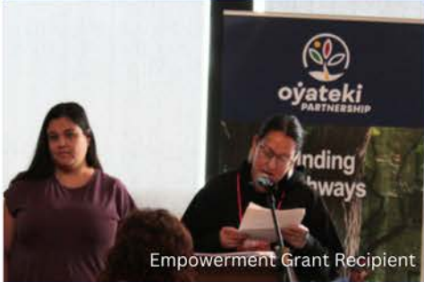
Empowerment Grant Recipient